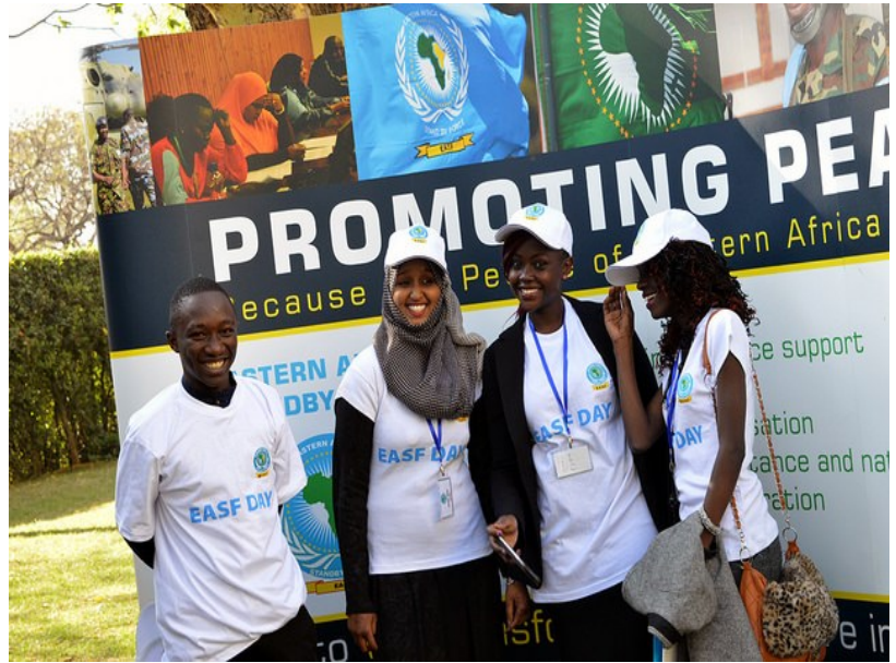
EASF is reaching out to the youth to encourage dialogue that facilitates peace initiatives.

As a part of EASF Communication and Advocacy Strategy 2015 – 2017, the concept on EASF Promotion Team was introduced. The purpose of the “Promotion Team” is to offer EASF visits to interested and relevant target groups such as universities, secondary and high schools, international organisations and NGOs, national authorities such as ministries, departments and other institutions, peace research institutions, “Interest Groups”, etc. with the aim to raise awareness and understanding for the being of EASF. The first contacts with interested groups have been conducted.