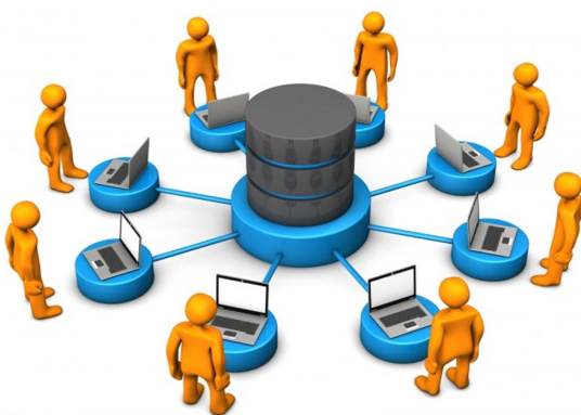
The figure illustrates the set up of the EASF intranet serving EASF staff from different locations.

The month of March 2017 sees EASF launch its Intranet; a platform designed as an integration of four basic elements – information services, an internal web server, communication links and users. The webserver contains databases and other repositories of diverse files such as documents in text form and multimedia content. The platform will use the now improved Local Area Network (LAN) thus ensuring more efficient and faster transfer of huge files from the files' server to end-users.