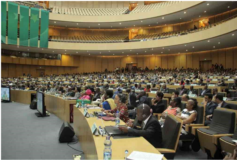
Participants follow proceedings during the AU Summit in January 2017 in Addis Ababa