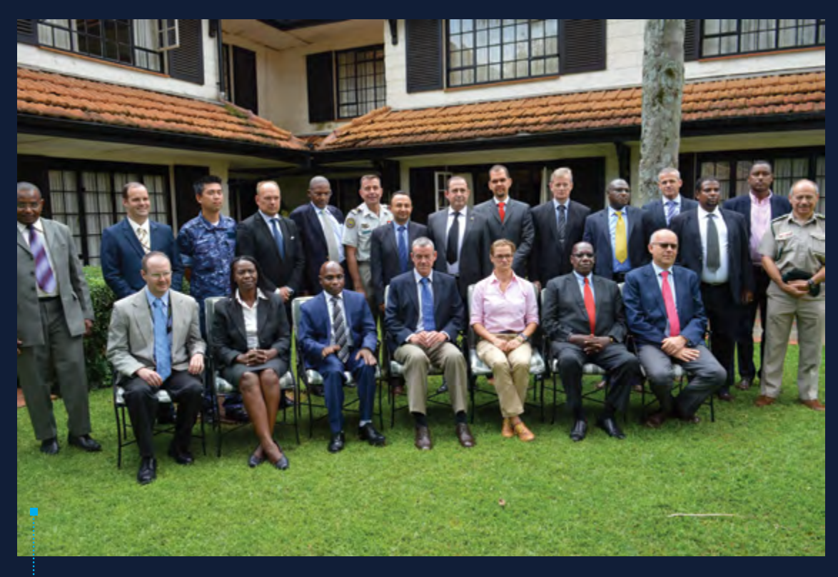
Friends of EASF with EASF staff during an EASF-Friends meeting in April 2016 in Nairobi