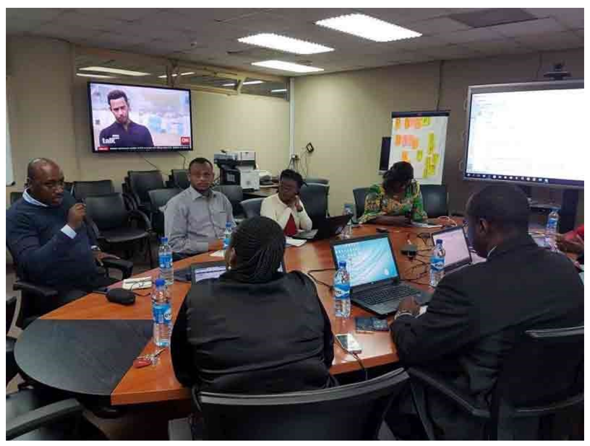
EASF Early Warning Team during the Benchmarking Exercise in Abuja, Nigeria

he EASF Early Warning team conducted a benchmarking Exercise at the Headquarters of the Economic Community of West African States (ECOWAS) in Abuja, Nigeria from July 18 – 19<sup>th</sup>, 2017.