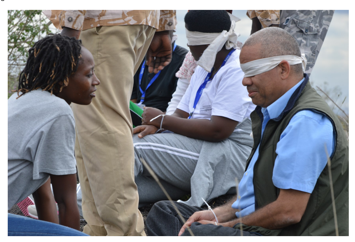
EASF staff with other participants in a practical Exercise during the Civilian Foundation Training at the Humanitarian Peace Support School, Nairobi

and was attended by 30 participating civilian trainees from EASF Member States, Officers from the United Kingdom, course facilitators and other invited guests. The course has been funded through the Government of the United Kingdom.