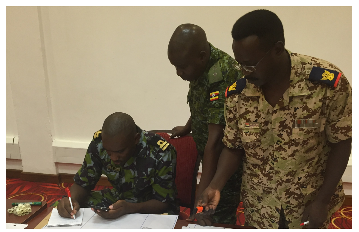
EASF Staff during the Maritime Task Force Command (MTFCC) course in May 2017

ASF conducted a Maritime Task Force Command (MTFCC) course in May 2017 in Mombasa, Kenya to further enhance skills necessary for maritime officers to command a maritime task force during Maritime Peace Support Operations (PSOs) in particular the Maritime Safety and Security (MSS).