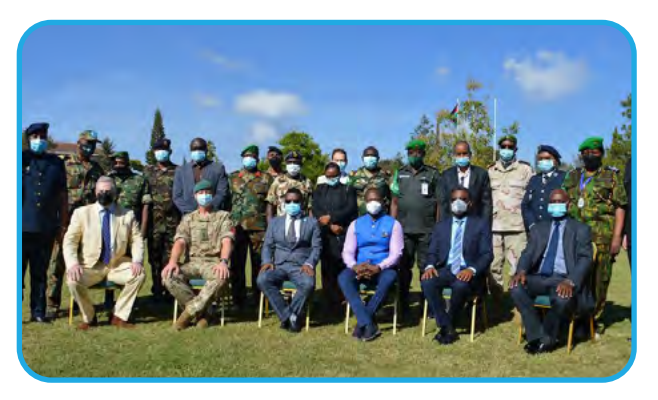
<u>AU setting standards for Integrated Mission</u> Planning for RECs/RMs, 28 February (Kenya)