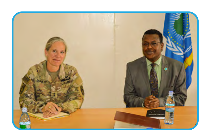
<u>Commanding Gen. of Combined Joint Task</u> <u>Force-Horn of Africa, Maj Gen Jami Shawley</u>