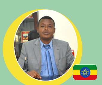
Brigadier General Getachew Shiferaw Fayisa Ethiopia 2020-